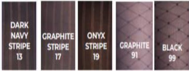
SERIES 710 WOMEN PATTERNS STYLE: PANTYHOSE & THIGH HIGH