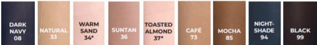
SERIES 780 SHEER WOMEN

***** (MATERNITY PANTYHOSE ONLY AVAILABLE IN COLOR #33 & #99)