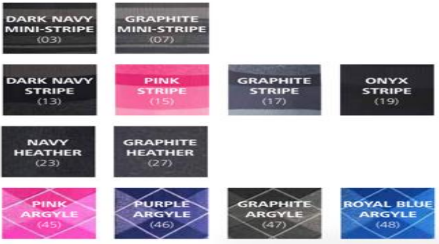
SERIES 830 MEN/WOMEN ( MICROFIBER PATTERNS)